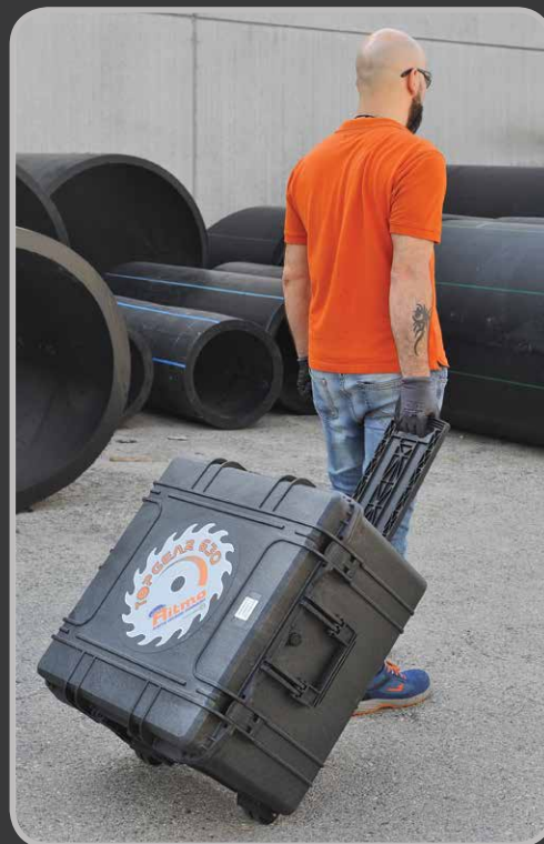
Easy and light to carry (saw only)